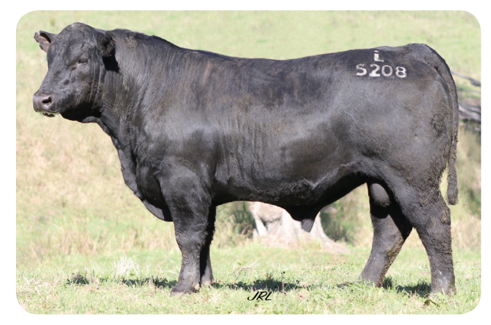
Sire: Knowla Quantum Q4 I CE.Dir Birth 400 600 CWT EMA IMF% $A-L +5.9 +1.8 +90 +112 +71 +10.7 +3.8 $376

All sire identified and genomic tested. Catalogue online with hard copy available early July.