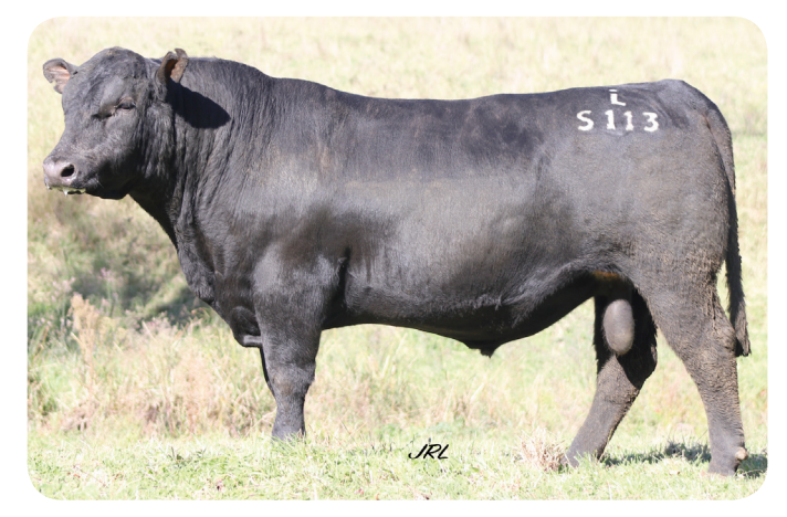
Sire: Landfall Nobleman N I 06 CE.Dir Birth 400 600 CWT EMA IMF% $A-L +6.5 +0.3 +100 +123 +88 +10.4 +3.0 $443