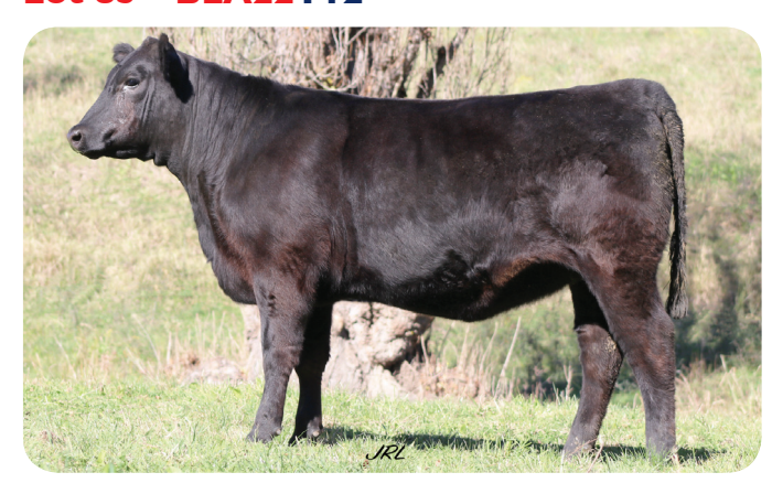
Sire: Knowla Novatel N131

CE.Dir Birth 400 600 $A-L Milk EMA +9.7+2.7+103+134+5.9+3.0$438