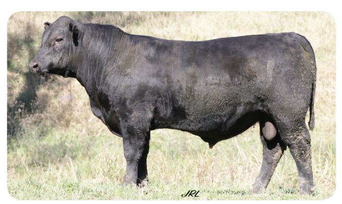
Sire: Knowla Nobleman N127