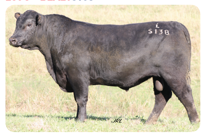
Sire: Knowla Quantum Q4 I CE.Dir Birth 400 600 CWT EMA IMF% $A-L +5.3 +3.5 +111 +142 +82 +9.1 +3.0 $418