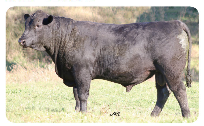
Sire: Knowla Pepper P91

CE.Dir Birth 400 $A-L CWT +3.9$474 +128+6.7+173+101+4.0