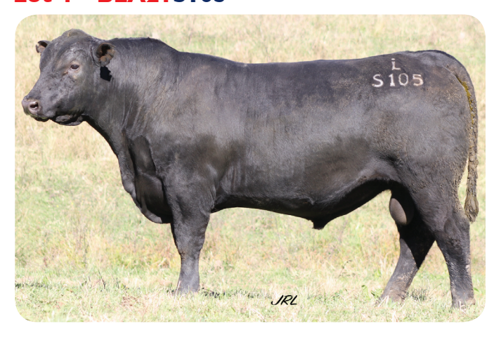
Sire: Dunoon Prime Minister P758 CE.Dir Birth 400 600 CWT EMA IMF% $A-L -0.7 +5.5 +111 +150 +82 +8.8 +3.0 $419