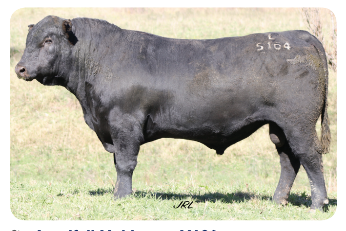
Sire: Landfall Nobleman N I 06 CE.Dir Birth 400 600 CWT EMA IMF% $A-L -3.8 +6.8 +125 +164 +104 +6.2 +1.1 $400