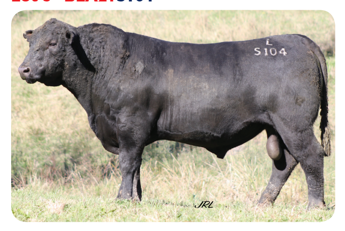
Sire: Dunoon Prime Minister P758 CE.Dir Birth 400 600 CWT EMA IMF% $A-+1.3 +5.1 +120 +166 +86 +10.0 +3.1 $45