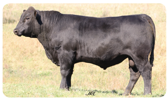
Sire: Knowla Nobleman N127