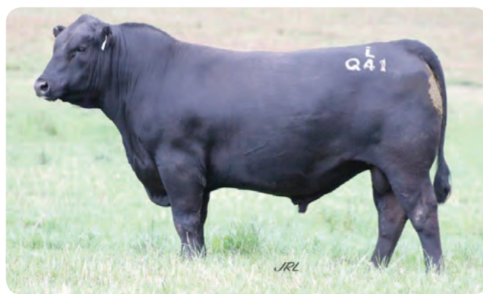
Knowla Quantum Q41