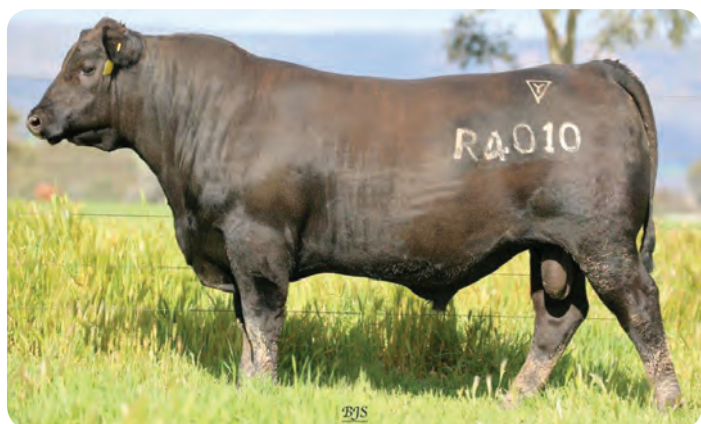
Lawson's Rocky R4010

In our December newsletter last year, we featured Prime Minister and Quantum Q41. Both bulls have outstanding calves on the ground and will be both in high use again this year. There are good reports coming in from around the industry on the Prime Minister calves and we are liking what we see here as well, with the bonus of getting very strong links in our herd with a prominent industry sire. Q41 has developed into an impressive individual and he is going to have a noticeable impact on our sale teams in the next few years. With a nicely balanced data set, tremendous temperament, and silky skin we are excited with what he has to offer.