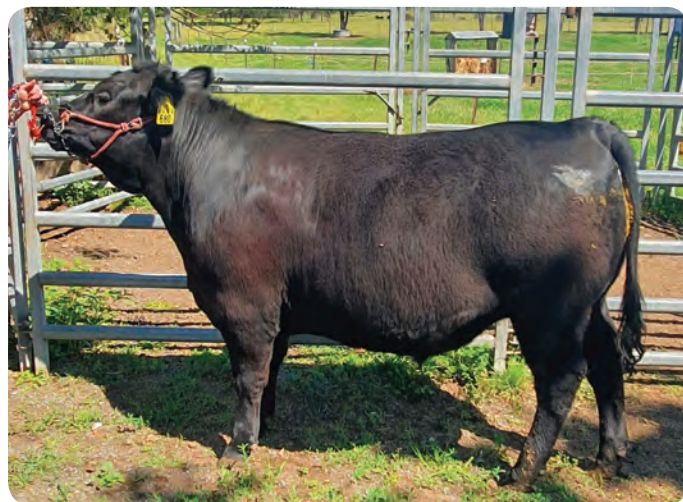
Upper Hunter Beef Bonanza Grand Champion carcass – Knowla Rambo R554.

Sired by Farrer Maxwell M99, we selected him on the back of the carcass data produced by the Maxwell steers in Cohort 9 of Angus Sire Benchmarking program, and for the exceptional temperament that his progeny exhibit. Maxwell's progeny were ranked first for EMA scan, fifth IMF scan, and fourth for carcass weight, but most importantly second overall for carcass value in Cohort 9.