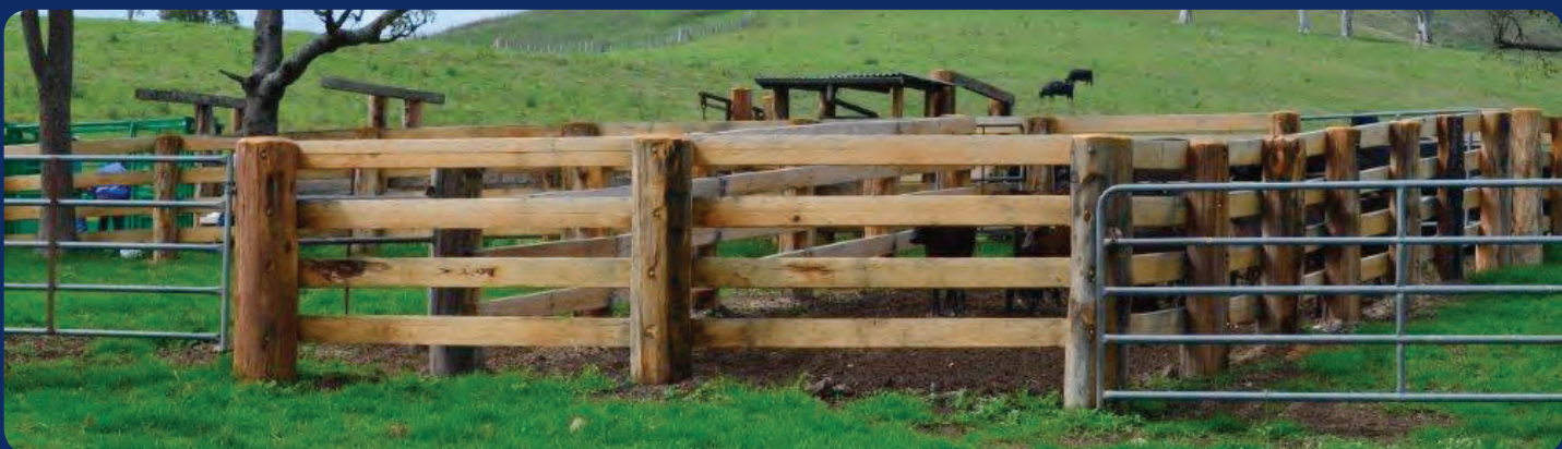
1965 model yards replaced.